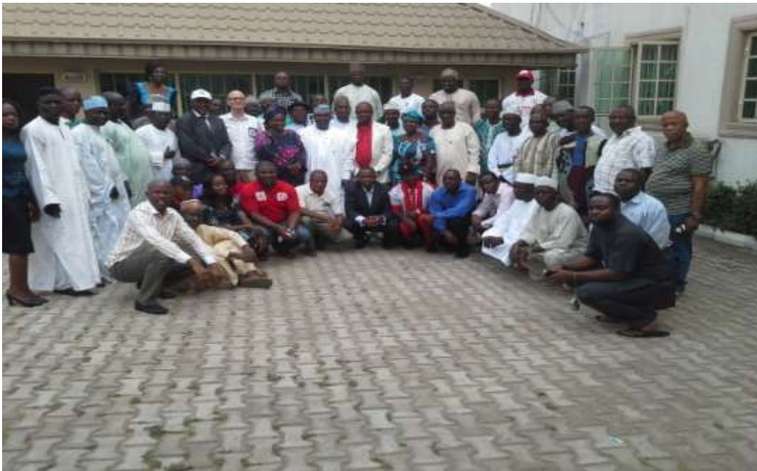
Figure 7: Group Photograph taken during the NRCS, NHQs Interactive & Annual Planning Meeting with the 36 Branches.

OD department also participated in the NYSC batch A 2013 pre-orientation course. This was held in Asaba, Delta State.