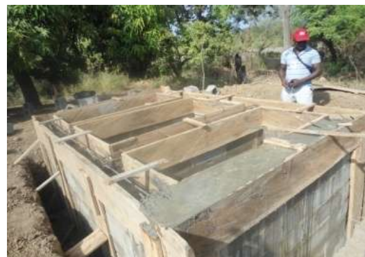
HH WATER TREATMENT DEMONSTRATION PIT LATERINE CONSTRUCTION