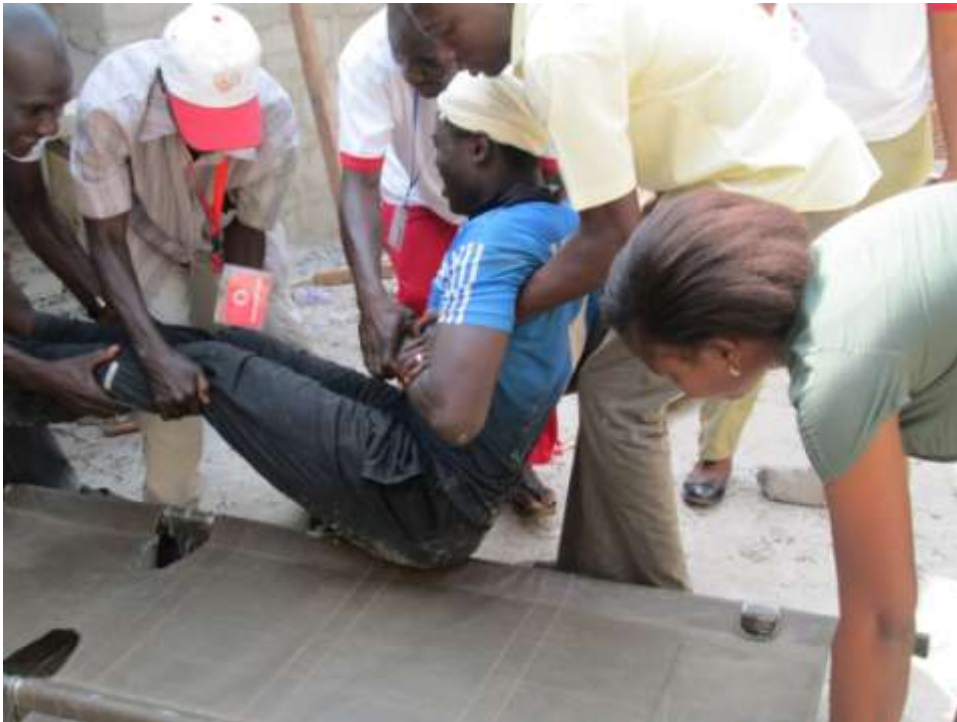
Volunteers at Training simulation

Community First Aid Training was also conducted for the 1 st Quarter 2013. In the various Branches supported by ICRC.