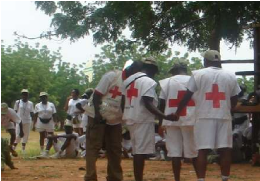
Volunteers Training at NYSC Camp

In the year 2012 From January to December more than 1586 volunteers of the Nigerian Red Cross Society have been trained on Competence Based Standard First Aid. These trainings took place in the following branches: Abuja, Abia, Cross Rivers, Delta, Enugu, Kebbi, Kano, Bauchi, Lagos, Rivers, Edo, Kaduna, Enugu, Rivers, Imo, Niger and Kwara.