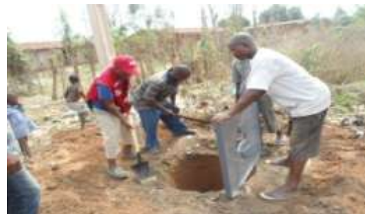
PIT LATERINE CONSTRUCTION