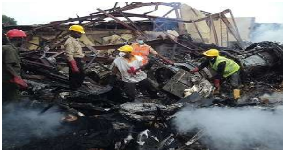
Red Cross volunteers and other stakeholders at the Dana plane crash site

On the 3 rd of June 2012, at approximately 3:43pm, a Dana plane crashed into a residential area while attempting an emergency landing in Lagos, killing all 153 passengers and crew on board. The crash site was in a heavily populated urban area and resulted in the death of at least 4 persons who were inside the buildings at the time of the crash, bringing the total number of deaths to 157 people, and 6 injured.