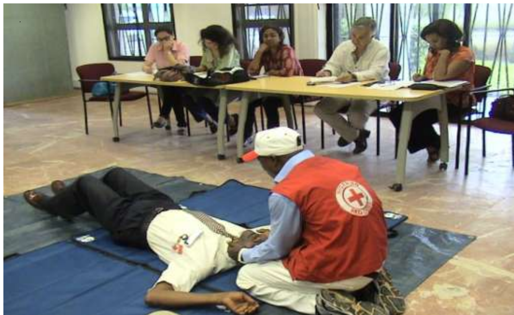
First Aid at Work Training