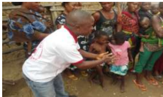
HAND WASHING DEMONSTRATION