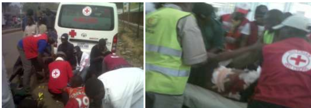
NRCS volunteers at work

The Federal government announced on January 1 st 2012 an increment in the pump price of petrol (PMS) and as a result, there were protests and strike by the Nigerian Labour Congress in different parts of the country with Kaduna, Kano, Lagos, Oyo and the FCT being more tense than other states. Consequently, it resulted in about 596 injured and 30 dead. The NRCS National Headquarters responded by putting branches on alert and monitored the situation until the strike was called off. The ICRC supported the National Society with communication support for the branches and also pre-stocked dressing kits in three branches of Borno, Gombe and Kano. Part of these prepositioned items were utilised during the response.