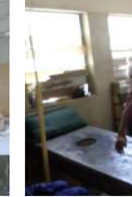
RC volunteers disinfecting hospital wards