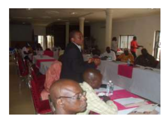
A cross section of participants at the workshop

On the 19th of June 2013, a communication workshop was organized for Branch Secretaries and National Society staff to build their capacities in the area of efficient and effective information dissemination to the media. They were also made to understand their role in disclosure of figures when communicating with the media. The workshop was supported by the ICRC. Sixteen (16) Branch Secretaries from violent prone areas were selected as participants out of the thirty seven branches.