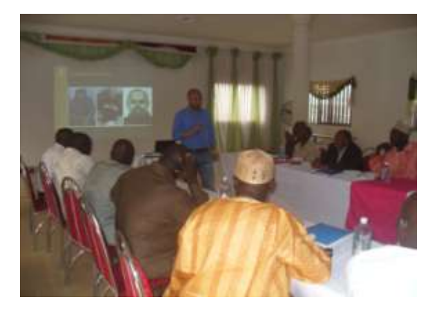
Presentation on Photography by ICRC Head of Comm. Geneva