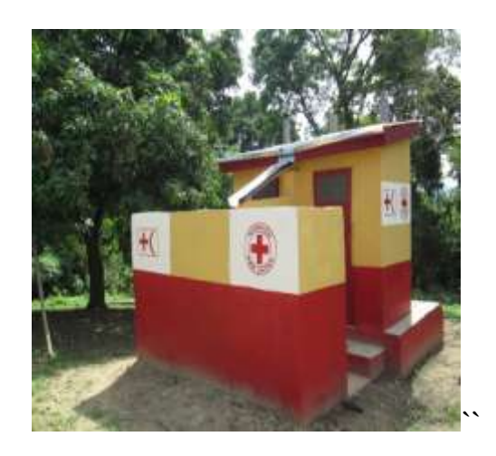
Construction of emergency latrine