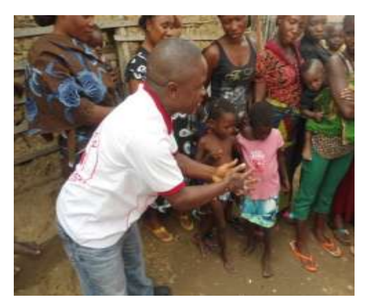
Water, Sanitation and Hygiene

To further mitigate the risk of water related diseases and other public health emergencies in the affected communities, The NRCS, in May 2013 conducted a 3-day Training of Trainers on School Hygiene and Health Education (SSHE) for 45 school teachers and Community Based Volunteers (CBVs) in Edo and Kogi States. This training is one of the strategies to increase the number of volunteers to disseminate health information and encourage hygiene promotion among community members, and was followed up by a step-down training and sensitization of school children and community members on Water, Sanitation and Hygiene integrating other health related issues.