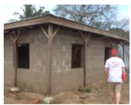
Recovery Shelter project