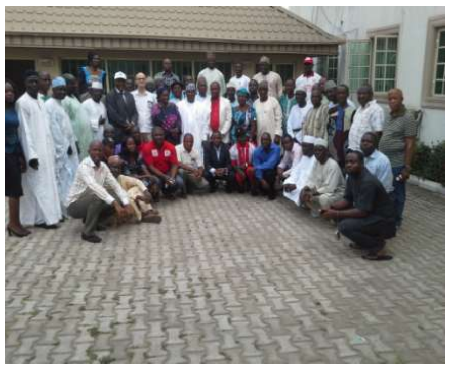
NRCS Planning Meeting with the Branches- 24th-27th January, 2013, Lokoja, Kogi State

OD department also participated in the NYSC Batch A and C 2013 pre-orientation courses held in Delta, Kwara states respectively.