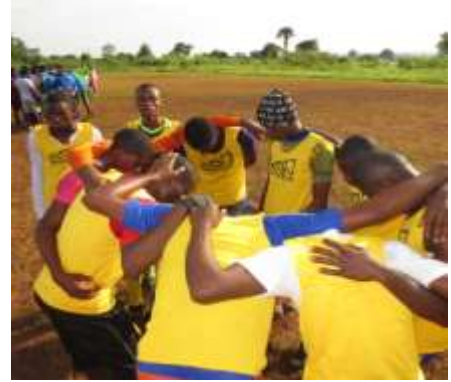
Sports activities during the camp