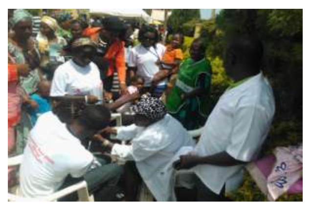
RC volunteers assist in vaccination exercise

A post campaign visit was carried out to identify children under the age of five who had not received measles or polio vaccinations. As a result, additional 44,041 families were visited and 15,779 children were identified and referred to government hospitals and clinics for vaccinations.