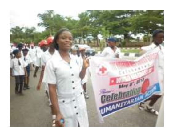
Young Red Cross Volunteers on a road walk to commemorate the World Red Cross Day