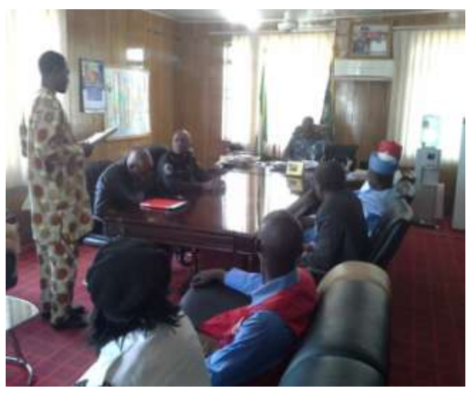
Advocacy Visit to Bauchi State Commissioner of Police, by the NRCS, NHQs Representatives